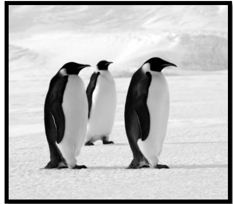
Photo of Emperor Penguins

• There are 17 different kinds of penguins. The smallest penguin is the Fairy Penguin, and it is 16 inches tall.