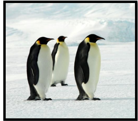
Photo of Emperor Penguins

• There are 17 different kinds of penguins. The smallest penguin is the Fairy Penguin, and it is 16 inches tall.