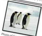
Photo of Emperor Penguins