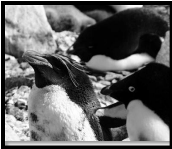
Photograph of a Macaroni Penguin

•Penguins march together to their nesting grounds (where the mamma penguins will lay their eggs). • Once the penguins arrive at the nesting grounds the penguins show off by dancing, nodding their heads, and making sounds to find their mate. •Most penguins stay with their mate for many years.